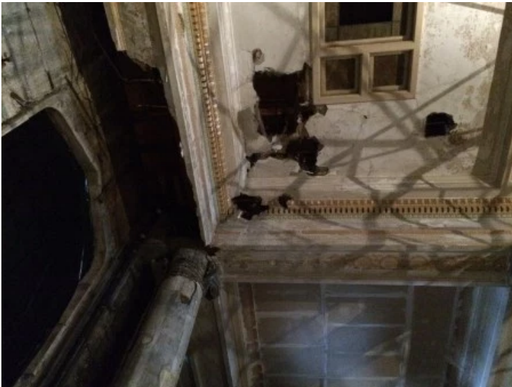
Avantika Bawa, installation, Astor Hotel, Astoria, Oregon

The history of the Astor Hotel is long and complicated, full of highs and lows and a tremendous number of setbacks. For its grand opening in 1924, according to exhibition information, a special fleet of automobiles was deployed to transport out-of-town muckety-mucks from the train station to the hotel. Less than 45 years later the building was declared "a public nuisance and a fire hazard."