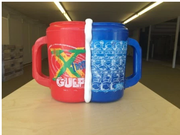
Heidi Schwegler, "OR (part two)", Portland 2016 biennial, Hazen Hardware installation

Walk in to Hazen and you will find yourself face-to-face with a gray powder-coated, chain-link cage, about 8-feet square and open at the top. The closed door to the cage lines up with the open door to the store, so you can only take a few steps before captivity confronts you. It's not immediately clear if the chain-link fencing is one of Schwegler's pieces or something left in the retail space by the previous owners. Actually, that's the case with many of the pieces in the show. In Schwegler's world, the veil between art and life is thin.