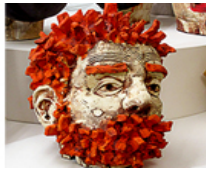
J.D. Perkin, "Island" (detail), 2016, ceramic, 17 x 14 x 19"

July 7 – 30, 2016 Opening Reception: Thursday, July 7, 5-8pm