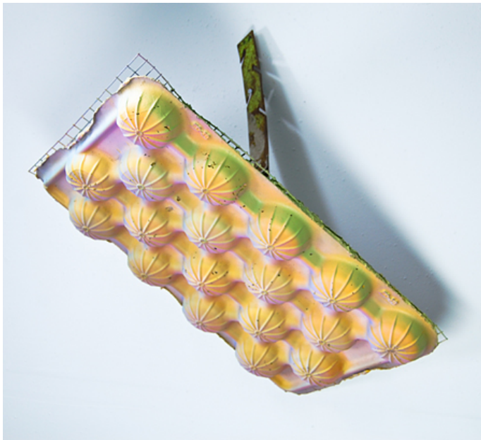
Colin Kippen, "Bracket," 2016, roofing bracket, concrete, shredded personal documents, wire mesh, acrylic paint, 15 x 23 x 15".