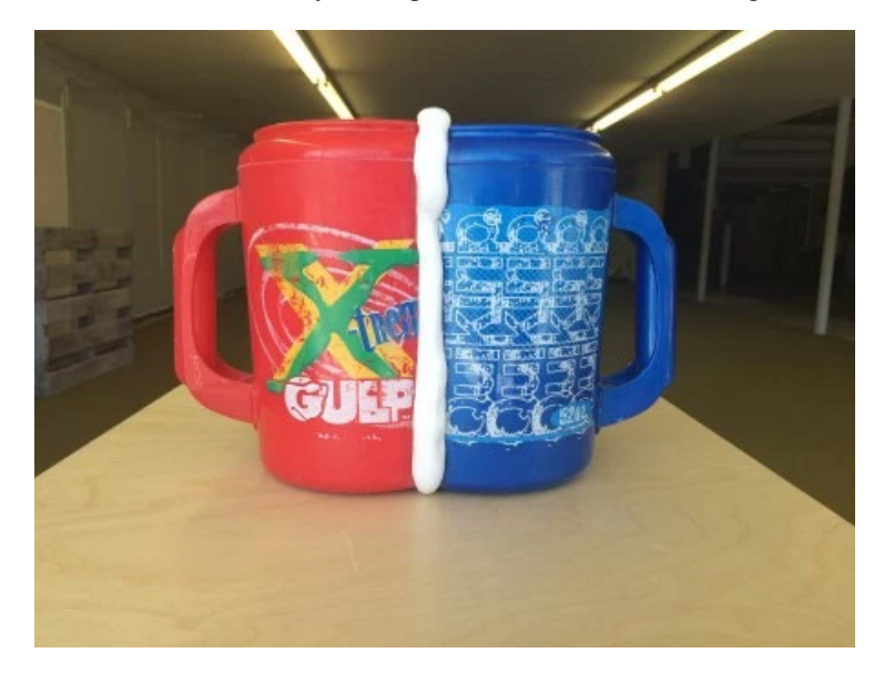
Heidi Schwegler,"OR (part two)", Portland 2016 biennial, Hazen Hardware installation

Walk in to Hazen and you will find yourself face-to-face with a gray powder-coated, chain-link cage, about 8-feet square and open at the top. The closed door to the cage lines up with the open door to the store, so you can only take a few steps before captivity confronts you. It's not immediately clear if the chain-link fencing is one of Schwegler's pieces or something left in the retail space by the previous owners. Actually, that's the case with many of the pieces in the show. In Schwegler's world, the veil between art and life is thin.